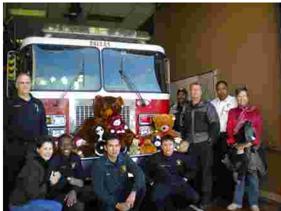
DCDAS MEMBERS WITH THE FIRE DEPARTMENT WITH OUR TEDDY BEAR SERVICE PROJECT.