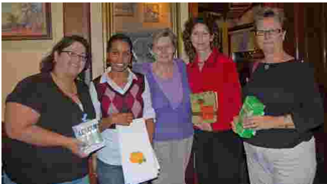
DOOR PRICE WINNERS